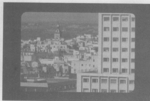
VAL DEL OMAR FUERA DE SUS CASILLAS